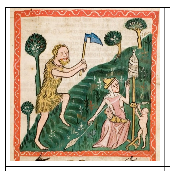
Fig. 5: Labors of Adam and Eve, Speculum Humanae Salvationis, Westphalia or Cologne, ca 1360. Darmstadt, Universitäts- und Landesbibliothek, Hs 2505, fol. 5r.

the project deconstructs and theorizes the historic association between women and textile work, using the distaff as a motif. Spinning with a distaff instilled patience and obedience in the spinner, as with Eve and Mary (Fig. 5). However, the weaponized distaff created chaos and subverted the "natural order" of male dominance (Fig. 6). The ambiguity of the distaff, capable of signifying women's obedience and disobedience, or submission and dominance, illustrates the complex web connecting womanhood with textiles.