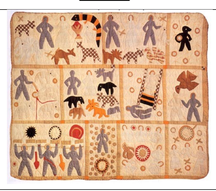
Fig. 1: "Bible Quilt" by Harriet Powers, 1886. Smithsonian National Museum of American History, Accession No. 283472. Licence: none (Public Domain).