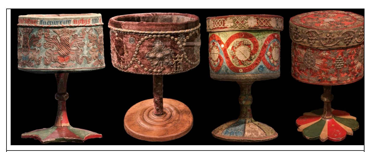
Fig. 12: Embroidered Reliquaries, Vadstena Abbey, ca 1500. Historiska Museet, Stockholm; Domkykomuseum, Linköping.

<u>Licence: CC-BY 4.0, https://creativecommons.org/licenses/by/4.0.</u>