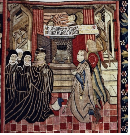
Fig. 10: Life of Walburga Tapestry, woven at St Walburga in Eichstätt, 1519. Images courtesy of Domschatz- und Diözesanmuseum Eichstätt.

Licence: CC BY 4.0, <a href="https://creativecommons.org/licenses/by/4.0">https://creativecommons.org/licenses/by/4.0</a>.