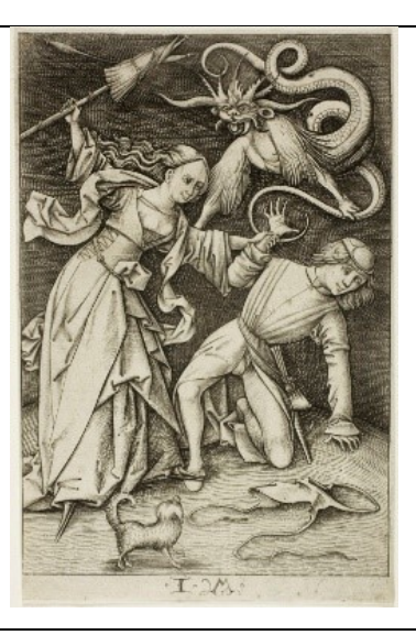
Fig. 6: Battle of the Breeches (The Angry Wife) by Israhel van Meckenem, Engraving, ca. 1495–1503. British Museum, Number 1848, 1125.141. Source: <a href="https://www.britishmuseum.org/research/collection-online/collection-object details.aspx?objectId=1402670&partId=1&searchText=meckenem,+wife&page=1.">https://www.britishmuseum.org/research/collection-online/collection-object details.aspx?objectId=1402670&partId=1&searchText=meckenem,+wife&page=1.</a>

Licence: CC BY-NC-SA 4.0, <a href="https://creativecommons.org/licenses/by-nc-sa/4.0">https://creativecommons.org/licenses/by-nc-sa/4.0</a>.