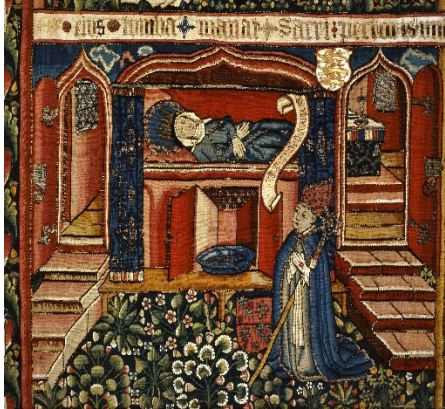
Fig. 9: Life of Walburga Tapestry, woven at St Katherine's in Nuremberg. 1456.

Licence: CC BY 4.0, https://creativecommons.org/licenses/by/4.0.