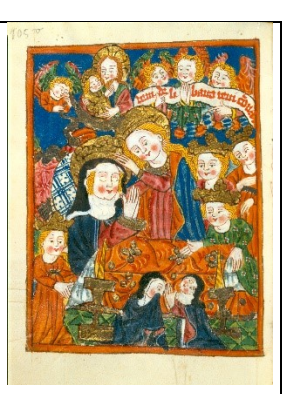
Fig. 7: Provost Choir Stall Hanging, Kloster Lüne, 1508. Museum für Sakrale Textilkunst, Kloster Lüne.

Licence: CC BY 4.0, https://creativecommons.org/licenses/by/4.0.